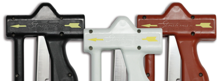
RENEWABLE COVER - BLACK