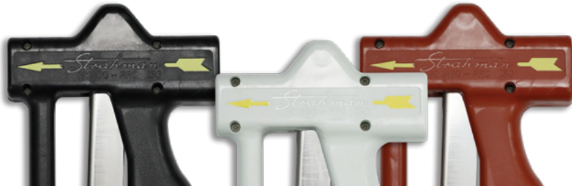
RENEWABLE COVER - BLACK