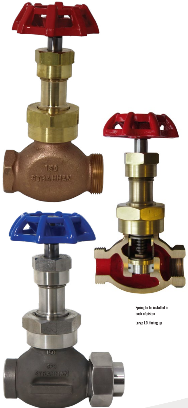
Spring to be installed in back of piston Large I.D. facing up

Base ring no longer necessary (older valves only).