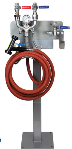
▶ Shown as complete washdown station mounted on a Strahman Duo Mod Pedestal stand (with an M-750TG, M-70 Spray nozzle, and Premium Hose)

The Strahman Multi-Series Airline wall plate is fully compatible with all Strahman Mixing Hose Stations, providing a seamless integration for your facility's needs.