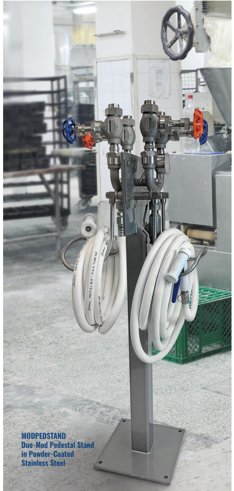
MODPEDSTAND Duo-Mod Pedestal Stand in Powder-Coated Stainless Steel