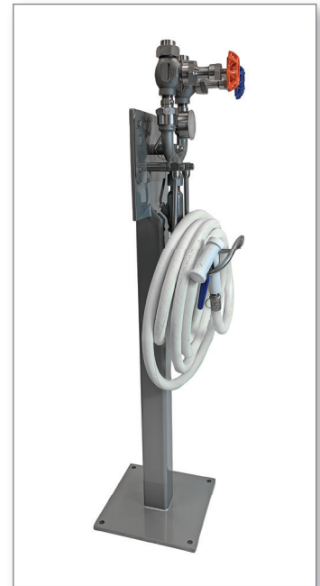
Duo-Mod Pedestal shown with two mixing stations