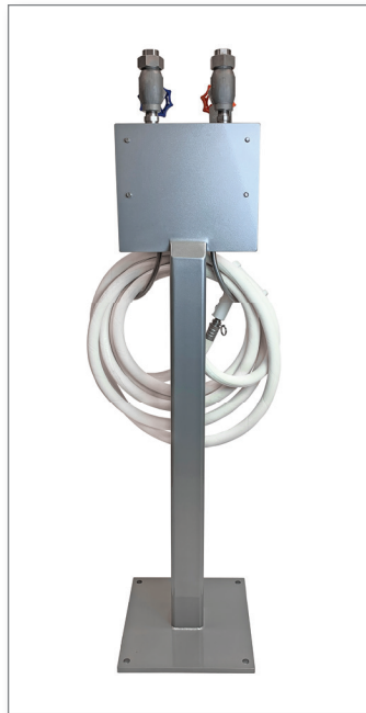
Duo-Mod Pedestal shown with one mixing station