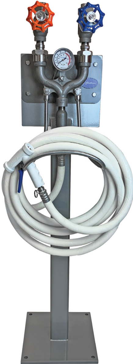
MODPEDSTAND Powder Coated Stainless Steel