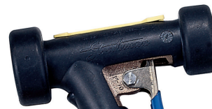
RUBBER COVER - BLACK