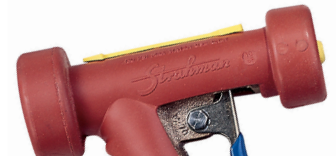
20R RUBBER COVER - RED