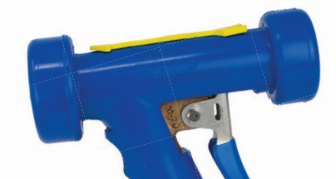
20R RUBBER COVER - BLUE