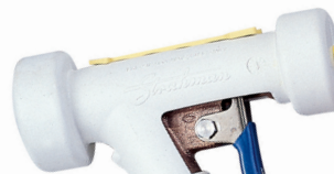
20W RUBBER COVER - WHITE