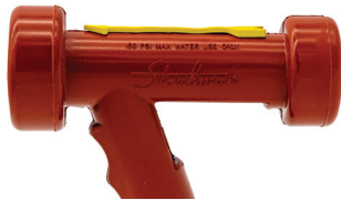
RUBBER COVER - RED