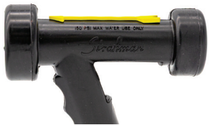
RUBBER COVER - BLACK

DIMENSIONS: 6¼" W X 5" H WEIGHT: 2¾ LBS. (W/O ADAPTER)