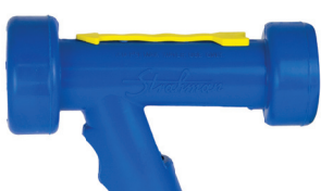
RUBBER COVER - BLUE