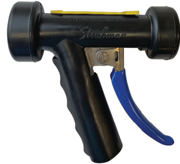
s-70 Stainless Steel