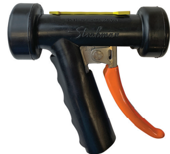
F-90 Stainless Steel