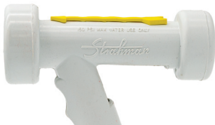
RUBBER COVER - WHITE