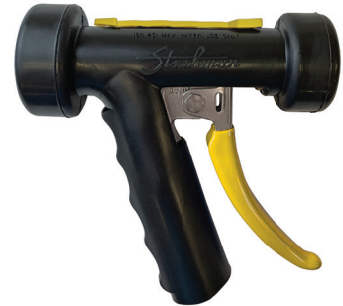
s-80 Stainless Steel