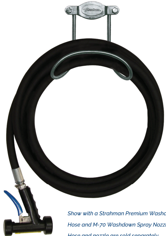
Show with a Strahman Premium Washdown Hose and M-70 Washdown Spray Nozzle. Hose and nozzle are sold separately.