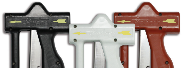
RENEWABLE COVER - BLACK