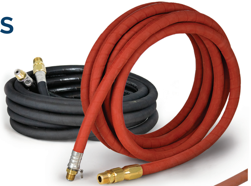
Shown ▲ Premium Wrapped Hoses